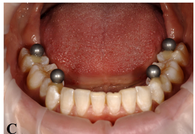
Fig. 1. (A) Transfer aid with spheres inserted. Application of composite on the spheres. (B) Placing the spheres on the teeth, light curing the composite, magnets are attached with composite to the upper side of the transfer aid. (C) Spheres fixed to the teeth.

round recesses on the underside of the TA by magnets without any movement range.